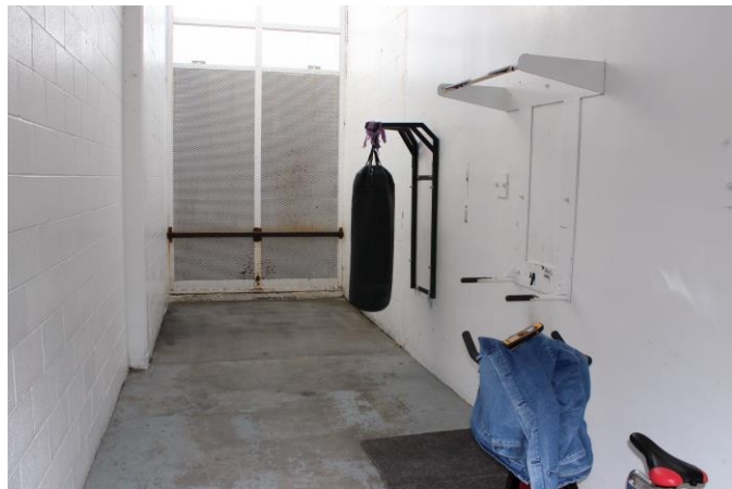
Rec area in Section One of the BHU

Conversations with BHU prisoners suggest that their consistent failure to shower or exercise is not caused by a lack of interest in those activities. They told us that they are not able to access showers and recreation because of how these opportunities are “offered.” Shower and rec invitations begin at 6am. The powerful psychiatric medications that most BHU