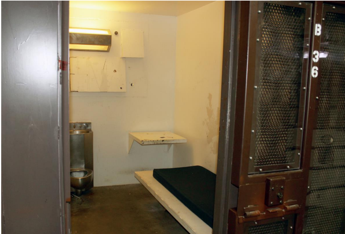
Empty cell in Section 2 of the BHU

that you are seeing conditions from a past century when mental illness was primarily “treated” through a combination of warehousing and isolation.