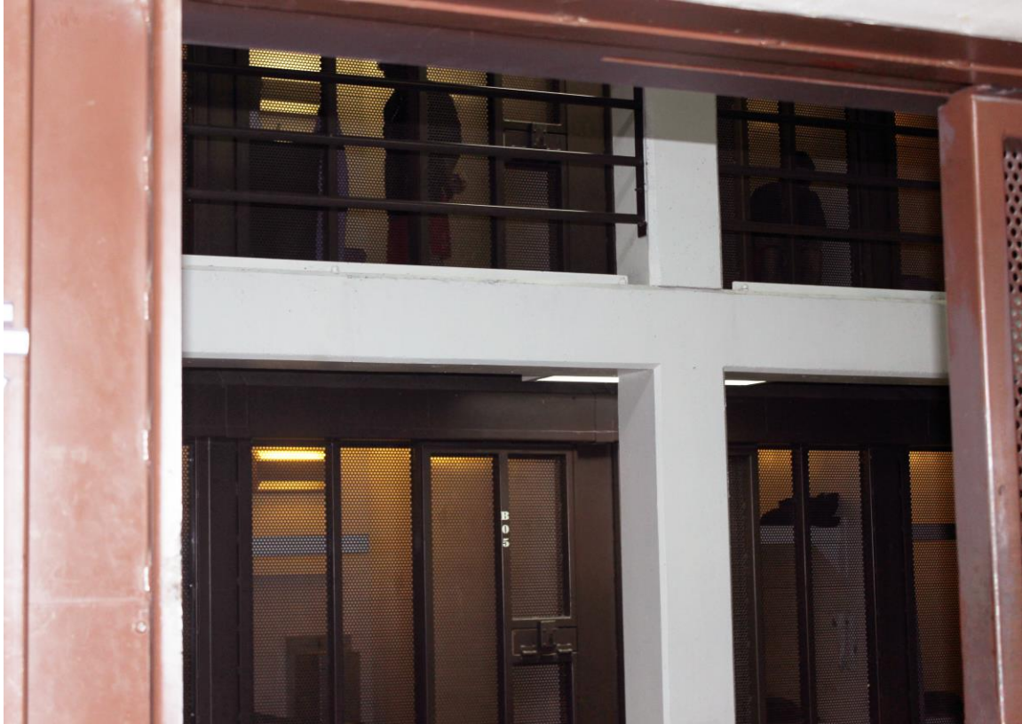
Entrance to Section 1 of the BHU

The pictures of the Behavioral Health Unit that we have included in this report cannot accurately convey what it is like to be there. To see the cells where each BHU prisoner spends an average of 23 hours a day, you walk through other parts of the prison. The hallways and rooms are reminiscent of an aging high school. As you get close to the cell tiers and the last of eleven electronically locked and controlled doors, you begin to hear prisoners randomly screaming, talking to themselves, and rhythmically banging walls and metal. You pass underneath a glassed-in control tower where clipboards, face shields, and radios are hung. You then wait to go through one of three heavy, metal mesh doors that are controlled by the tower. After that, it's about a 40 foot walk across a deserted floor to a two-level tier of cells. The feeling that you get as you get closer to the cells is