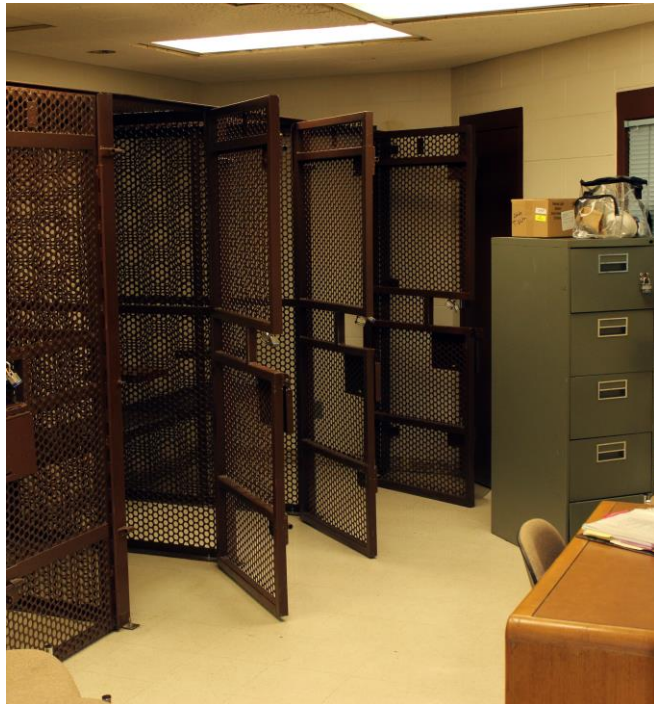
Education room where DBT takes place

In the BHU, the successful completion of DBT classes is one of the requirements for transitioning out of the unit, and participation is a component of every BHU treatment plan. Participation and progress in learning DBT skills is also a stepping stone toward greater privileges in the BHU.