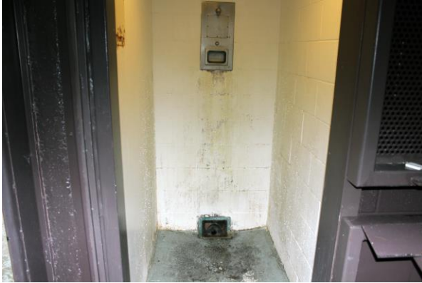
Shower in Section 2 of the BHU

ODOC policy requires prisoners to be offered the chance to shower and exercise several times per week, but our review of 476 pages of BHU shower and rec logs indicates that very few BHU prisoners reliably access the opportunity to shower and “go to rec.” Daily logs for the three year period between 2011 and summer 2014 establish that the vast majority of