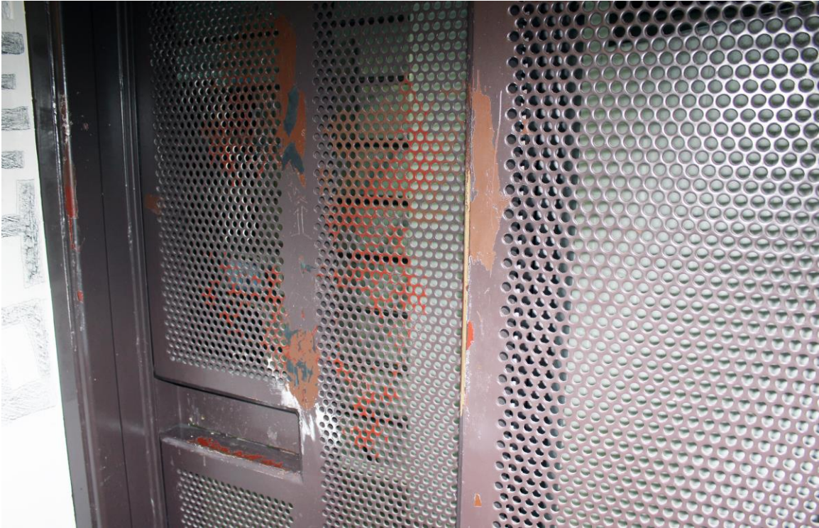
Inside a Section 2 BHU cell

McClary v. Kelly , 4 F.Supp. 2d 195 208 (W.D.N.Y. 1998).