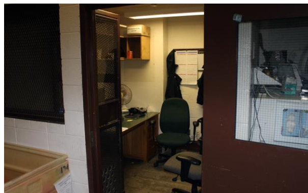
BHU staff office

Officers who sometimes bear ill will toward individual BHU prisoners frequently participate in treatment team meetings where they learn confidential information that can then be used to retaliate against those prisoners. Similarly, multiple MH providers told us that the cramped space of the BHU means that officers who are not part of a meeting can easily overhear treatment team discussions. It should be noted that these